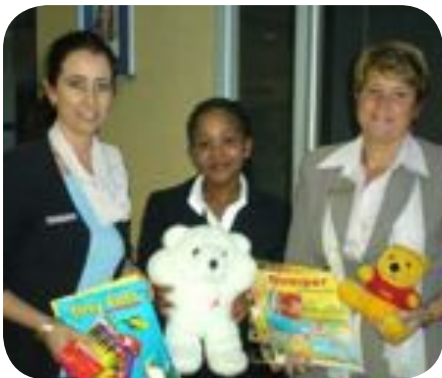
Standard Bank Walmer ladies collecting toys